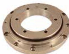
ROTOR BEARING F-589 | OEM: 3100589