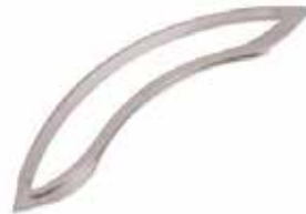
25MM SLIDE IN SEAL - TITANIUM F-93/T | OEM: N/A