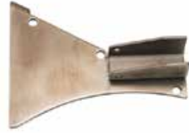
SCRAPER BLADE COVER F3-5 | OEM: N/A