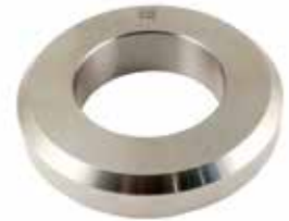
PRESSURE ROLL W/O BEARING F-89 | OEM: 3114089