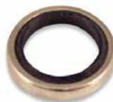
PUNCH SEALS LOWER "B" F-546 | OEM: 3115546