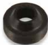
SCRAPER A 10 X 18 X 8/5 F-759 | OEM: 2148759