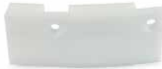
LUBE CAM COVER IPT 19 - DELRIN F-024 | OEM: 3133024