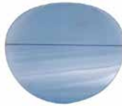
OVAL PANE FOR FEEDING HOPPER 92MM F-292 | OEM: 3116292