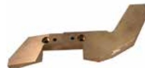
TRANSITION CAM-LOWER PRECOMPRESSION ROLL F-557 | OEM: 3110557