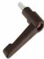
ADJUSTABLE CLAMPING LEVER F-835 | OEM: 2143835