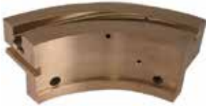
14MM FILL CAM - IPT 19 F21-817 | OEM: 3102817