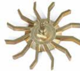
FILLING WHEEL - PLOW F-464/1 | OEM: 3501464