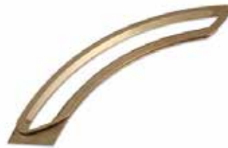
SLIDE-IN BRONZE SEAL - 16MM F-32 | OEM: 3128632