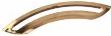
SLIDE-IN BRONZE SEGMENT - 15MM OPEN F3-14/2-1-15 | OEM: N/A