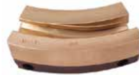
11MM - FILL CAM - COMPLETE - EU1"/441 FD3-11CE4 | OEM: N/A