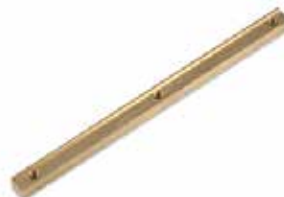
SCRAPER F-640 | OEM: 3114640