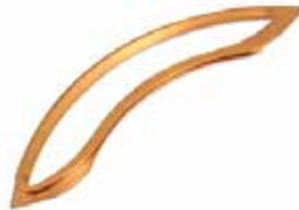
25MM SLIDE IN BRONZE SEAL F-93 | OEM: 3136193