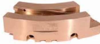
12MM FILL CAM IPT 1" F-4433 | OEM: 3114433