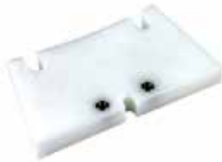
COVER FOR HOLDING LEDGE - DELRIN - IPT 19 OR IPT 1" F-171-P | OEM: 33330401713