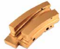
18MM FILL CAM IPT 1" F-895 | OEM: 3112895