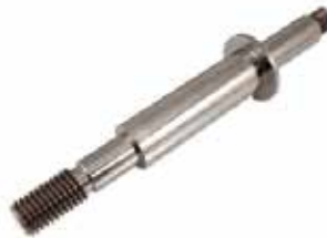
ROTOR SHAFT F-027 | OEM: 4070247