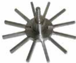
ROTARY VANE F-096/1 | OEM: N/A