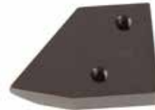
EJECTION PLATE F10-053 | OEM: N/A