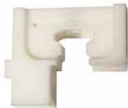
HEAD LUBE CAM - EU 19 F-390 | OEM: 3118390