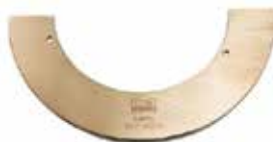
HOLD DOWN LEDGE - EU 1 F-4836 | OEM: 3114836