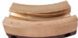
18MM FILL CAM - COMPLETE - IPT 19 FB3-18C | OEM: N/A