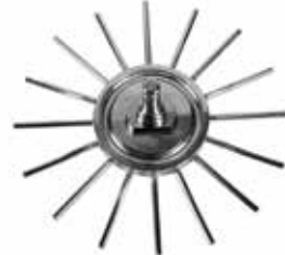
DOSING WHEEL WITH ROUND RODS F-816 | OEM: N/A