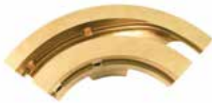
UPPER LOWERING CAM - EU 19 F-812 | OEM: 3118812