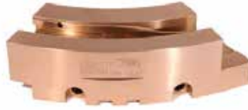
FILLING CAM 16MM IPT 1" F-4435 | OEM: 3114435