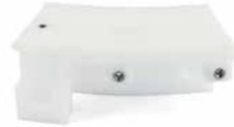
LUBE CAM FOR HEAD AND OUTER SHANK IPT 19 - DELRIN F-020 | OEM: 3133020