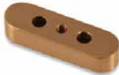
FEATHER KEY DIN6885 F-05 | OEM: 3781905