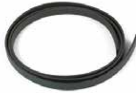
PUNCH RESTRAINER 19 F-705 | OEM: 3772705