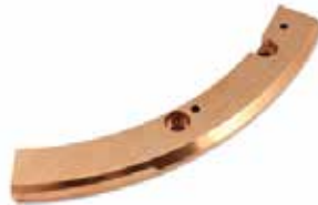
TRAP LEDGE FOR DOSING - IPT19 F-927 | OEM: 3110927