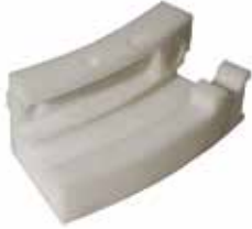
LUBE CAM TOP - FOR HEAD & SHAFT LUBE - INSIDE - EU1/441 F-17 | OEM: 3133017