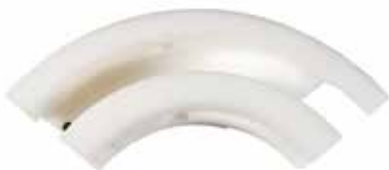
UPPER LOWERING CAM WITH HEAD LUBE - EU1-441-PLASTIC F-825 | OEM: 3118825