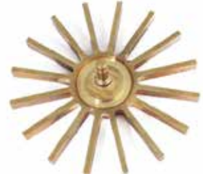
METERING WHEEL W/FLAT RODS F-465 | OEM: 3501465, 3501465C