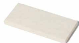
LUBE FELT FOR PUNCH SHANK (WIPING FELT) F-612 | OEM: 3101612