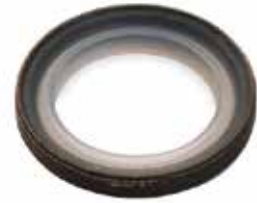
PUNCH GUIDE SEAL - 3/4"/19MM F-667 | OEM: 2147667