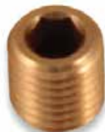
S.H. SET SCREW N-6833 | OEM: N/A