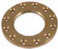
BEARING RETAINER PLATE-TAMPING ROLLER ASSEMBLY F-299 | OEM: 3100299