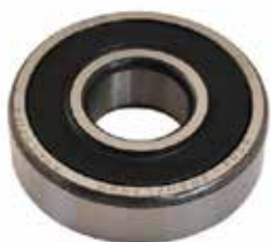
BEARING FOR PRE-COMPRESSION ROLL F3-46 | OEM: 31-23-046