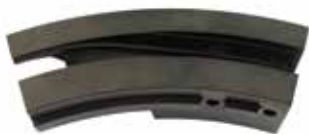
UPPER RAISING CAM - STEEL- IPT 19 F-218 | OEM: 3116218