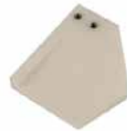
TAIL OVER DIE F-940 | OEM: 3109940