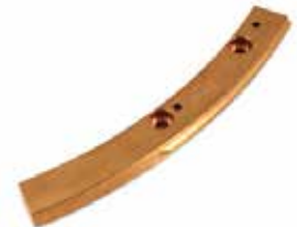
INSIDE GRIP LEDGE - IPT 1" F-755 | OEM: 3109755