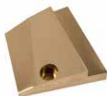
STARTER PIECE FOR WEAR PLATE F-202 | OEM: N/A