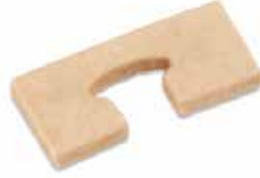
LUBE FELT FOR FLAT CAMS IPT 19, EU 19 F-463 | OEM: 3119463