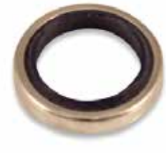
PUNCH SEALS LOWER "B" F-546 | OEM: 3115546