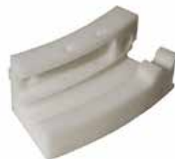
LUBE CAM TOP-FOR HEAD & SHAFT LUBE-INSIDE-EU1-441 F-17 | OEM: 3133017