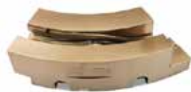
FILLING CAM 20MM - EU 19 F-900-20 | OEM: N/A