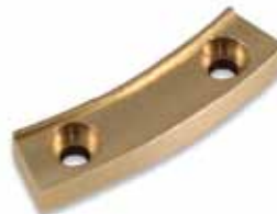
SEGMENT CENTRAL STOPPER F-370 | OEM: 3110370