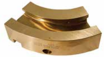
6MM FILL CAM - IPT 19 F-784 | OEM: N/A