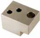
GUIDE BLOCK FOR LARGE PRESSURE SCREW ON THE DIE TABLE F-597 | OEM: 3115597