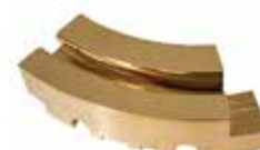
FILLING CAM - 8MM - EU19 F-858 | OEM: 3110858