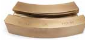
16MM - TRACK SECTION ONLY - EU1" FD3-16TE4 | OEM: N/A