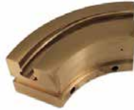
12MM FILL CAM - IPT 19 F-691 | OEM: N/A