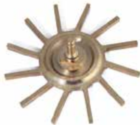
REVERSE DOSING WHEEL W/FLAT RODS F-66 | OEM: 3501466C