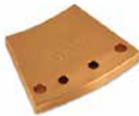
WEAR PLATE F10-915 | OEM: 3113915