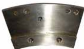
WEAR PLATE- EJECTOR F-567 | OEM: 3111567