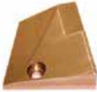
TIGHT PUNCH CONTROL DOSING F12-816 | OEM: 3113816