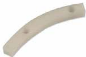
SEALING GASKET - DELRIN (2 HOLE) F3-14/1-1P | OEM: N/A