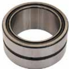
BEARING FOR ROLL F-77 | OEM: 3023077