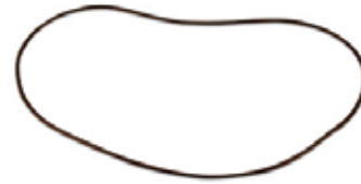
O-RING F-793 | OEM: 2147793