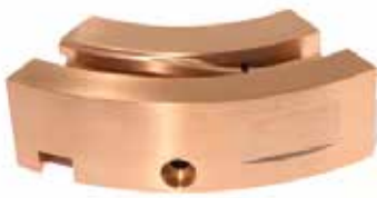
12MM FILL CAM - EU-B F-746 | OEM: 3114746