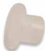
SILICON PLUG FOR TOP CAM F-533 | OEM: 3109533