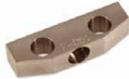
FASTENING FOR GUIDE COLUMNS F-061 | OEM: 3114061