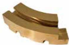
FILLING CAM-14MM - EU 19 F-897 | OEM: N/A