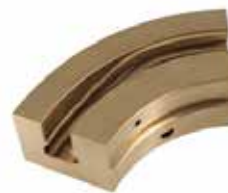
12MM FILL CAM EU B F-748/12MM | OEM: N/A