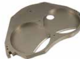
FEEDER BASE PAN F-126 | OEM: 3112126C