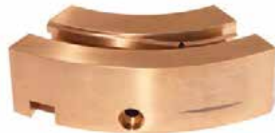
10MM FILL CAM EU19 F-807 | OEM: 3114807