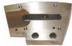
GUIDE - METERING HEAD F-730 | OEM: 3109730