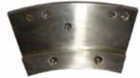
WEAR PLATE- EJECTOR F-567 | OEM: 3111567