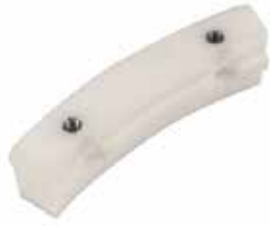
PLASTIC HOLDING LEDGE - PUNCH REMOVAL F-714 | OEM: 3117714