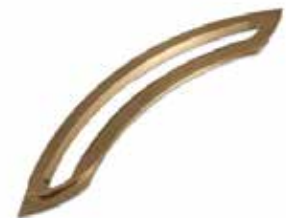
SLIDE IN BRONZE SEAL FOR STANDARD F-O-M TABLETS UP TO 11MM F-34 | OEM: 3127034