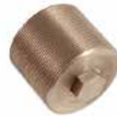
SPRING COVER F-187 | OEM: 3108187