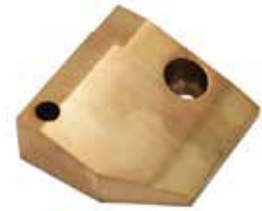
THRUST PIECE (EJECTION RAMP) F12-765 | OEM: 3113765