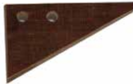
TAIL OVER DIE F3-11 | OEM: 45-23-011