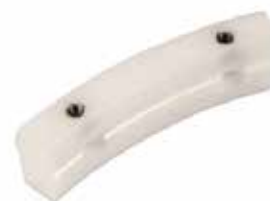
HOLDING BAR FOR PUNCH REMOVAL - DELRIN - IPT 1" F-163-P | OEM: 32310401631