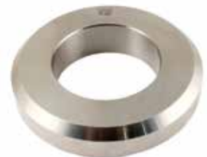
PRESSURE ROLL W/O BEARING F-89 | OEM: 3114089