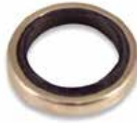
PUNCH SEALS LOWER "B" F-546 | OEM: 3115546