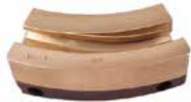
16MM FILL CAM - COMPLETE - IPT 19 FB3-16C | OEM: N/A