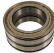
BEARING FOR PRESSURE ROLL SG-513-BRG | OEM: N/A