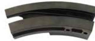
UPPER PUNCH LIFTING CAM IPT 19 F-193 | OEM: 3116193