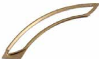
SLIDE- IN BRONZE SEAL 25MM F-633 | OEM: 3128633