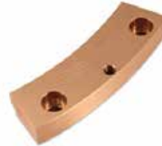
LOWER DOSING CAM - IPT 19 F-928 | OEM: 3110928