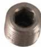
SET SCREW - CAMBODY F-570 | OEM: N/A