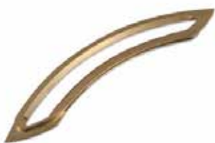
SLIDE IN BRONZE SEAL FOR STANDARD F-O-M TABLETS UP TO 16MM F-35 | OEM: 3127035