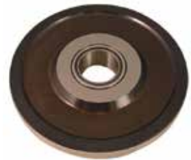
PRESSURE ROLL WITH BEARING F-6 | OEM: 3023006