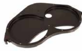
F-0-M BOTTOM PLATE - EARLY MODEL F2-24E | OEM: N/A