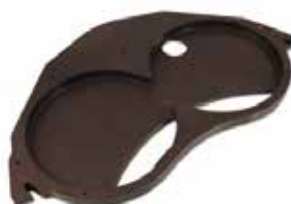
F-O-M BASE PLATE F-283 | OEM: 3504283