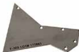
COVER FOR SCRAPER F-363 | OEM: N/A