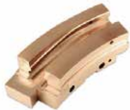
12MM FILL CAM - IPT 19 F-484 | OEM: 3113484