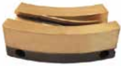
20MM FILL CAM - COMPLETE - IPT 1" FD3-20C | OEM: N/A