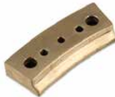
LEDGE CAM - IPT 19 F-687 | OEM: 3101687C