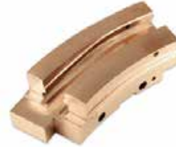
10MM FILL CAM - IPT 1" F-110 | OEM: 3211040110