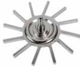
REVERSE DOSING WHEEL W/ FLAT RODS - STAINLESS F-66/S | OEM: N/A