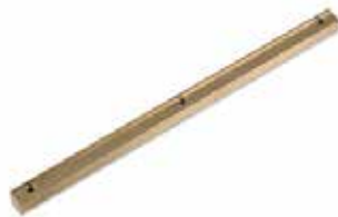
SCRAPER BLADE F12-397 | OEM: N/A