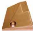
TIGHT PUNCH CONTROL DOSING F12-816 | OEM: 3113816