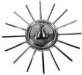
DOSING WHEEL WITH ROUND RODS F-816 | OEM: N/A