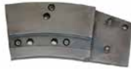
BASE PLATE FOR EJECTOR F-002 | OEM: 3109002