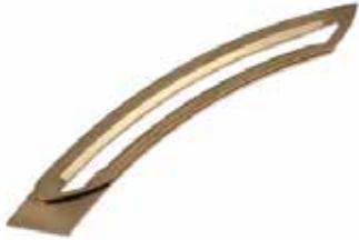
SLIDE IN BRONZE SEAL 11MM F-636 | OEM: 3128636