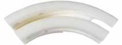
PULL DOWN CAM - PLASTIC - EU 19 F-737 | OEM: N/A