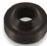
SCRAPER A 6X12X6/4 F-907 | OEM: N/A