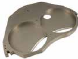
FEEDER BASE PAN F-126 | OEM: 3112126C