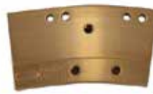
WEAR PLATE - EJECTOR F-003 | OEM: 3109003