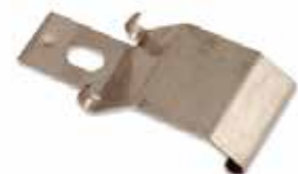
FELT HOLDER FOR SHAFT LUBRICATION F-673 | OEM: 31430401673