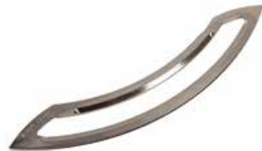
SLIDE-IN SEAL - 16MM - OPEN - TITANIUM F-35/T | OEM: N/A