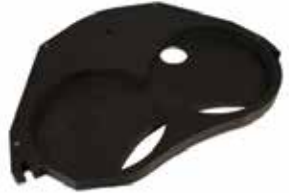
F-0-M BASE PLATE FOR BRONZE SEAL F-711 | OEM: 3113711