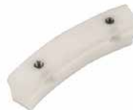
HOLDING LEDGE - PUNCH REMOVAL F-714 | OEM: 3117714