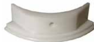
PRE-MAIN DWELL CAM - EU1-441 - PLASTIC F-826 | OEM: 3118826