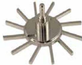
STAINLESS STEEL FILLING WHEEL F-696 | OEM: 3510696