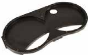
F-O-M BOTTOM PLATE W/ GASKET F3-14/1 | OEM: N/A