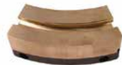
11MM - FILL CAM - COMPLETE - EU1"/441 FD3-11CE4 | OEM: N/A