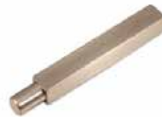
GUIDE KEY F-588 | OEM: 3109588, 3115597