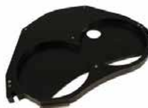
F-O-M BASE PAN - SPRING LOADED INSERT DESIGN F-735-1 | OEM: N/A