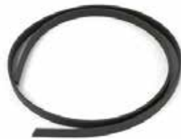
PUNCH RESTRAINER 19 F-406 | OEM: 3733406