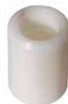
SLIDING SLEEVE FOR F-O-M F-308 | OEM: 3109308