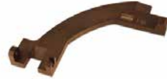
TRANSITION CAM BETWEEN PRECOMP & MAIN ROLLER F-321 | OEM: XX4321