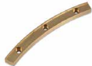
SEGMENT RIGHT STOPPER F-541 | OEM: 3114541