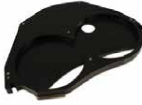
FEEDER BASE PAN - SPRING LOADED INSERT DESIGN F-735-1 | OEM: N/A