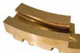
18MM FILL CAM - EU 1" F-069 | OEM: N/A