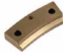
HOLDING LEDGE CAM - IPT 19 F-689 | OEM: 3101689C