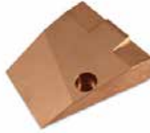
LEAD PIECE - EJECTOR - 32 STATION F-374 | OEM: 3113374