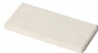
LUBE FELT FOR PUNCH SHANK (WIPING FELT) F-612 | OEM: 3101612