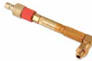
DOSING ELEMENT - ASSEMBLY 20 CMM F-031 | OEM: 3700334