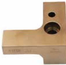
TRANSITION CAM - MAIN COMPRESSION F-3723 | OEM: 3113723