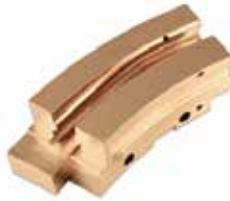
12MM FILL CAM - IPT 19 F-484 | OEM: 3113484