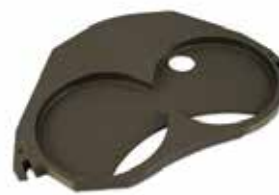
F-O-M BASE PLATE FOR BRONZE SEAL F-90 | OEM: 3136190