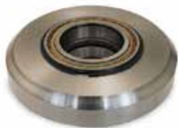
PRESSURE ROLL W/BEARING F-89/WB | OEM: 3114089