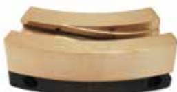
18MM FILL CAM - COMPLETE - IPT 1" FD3-18C | OEM: N/A