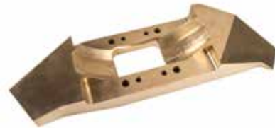
TRANSITION CAM - EU 45 F-683 | OEM: N/A