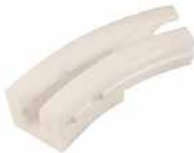
UPPER LOWERING CAM - DELRIN - IPT 1" F-190-P | OEM: 32310401901