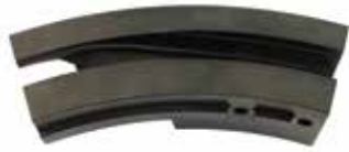
UPPER RAISING CAM - STEEL- IPT 19 F-218 | OEM: 3116218