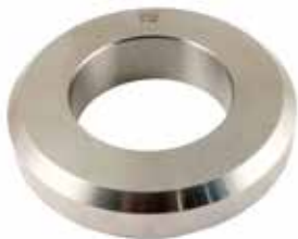
PRESSURE ROLL W/O BEARING F-89 | OEM: 3114089