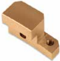
RETAINING PIECE - HOLDING LEDGE - SHORT F-956 | OEM: 3108956