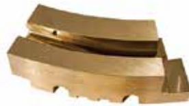
10MM FILL CAM - FAST PULL DOWN CAM - IPT 19 F-483/1 | OEM: N/A