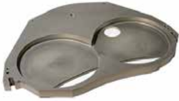
FILLING PLATE FOR BRONZE SEALING SEGMENT F-474 | OEM: 3131474