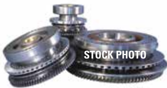
24 STATION TURRET ASSEMBLY* F12I-24T/A | OEM: N/A