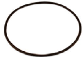
PUNCH RESTRAINER O-RING 165X3 F-106 | OEM: 3722106