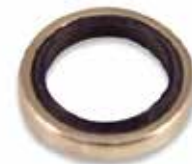
PUNCH SEALS LOWER "B" F-546 | OEM: 3115546