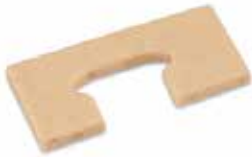
LUBE FELT/HEAD IPT 1" EU 1" FLAT F-026 | OEM: 3133026