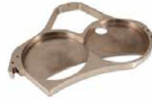
FEEDER PAN F-5 | OEM: 3128805