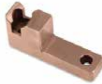
FEED FRAME BRACKET F-930-1 | OEM: N/A