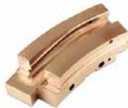
14MM FILL CAM EU 1" F-067 | OEM: 3132067