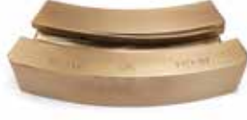
12MM - TRACK SECTION ONLY - IPT 19 FB3-12T | OEM: N/A