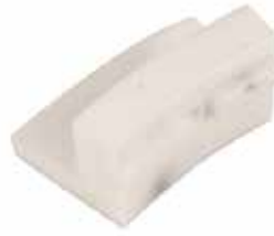
HOLDING BAR FOR SHAFT LUBE - DELRIN - IPT 1" F-168-P | OEM: 32310401681