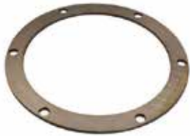
SHIM RING FOR CAM CARRIER TOP F-819 | OEM: 3108819