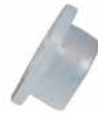
DRAIN PLUG F-902 | OEM: N/A