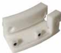
LUBE CAM FOR HEAD & OURTER SHANK EU1-441 F-3023 | OEM: 3133023