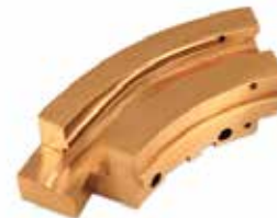
18MM FILL CAM IPT 1" F-4436 | OEM: 3114436