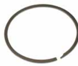
SNAP RING FOR PRESSURE ROLL BEARING SG-513-SR | OEM: N/A