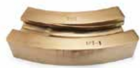
12MM - TRACK SECTION ONLY - IPT 1" FD3-12T | OEM: N/A