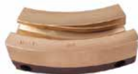
16MM - FILL CAM - COMPLETE - EU1" FD3-16CE4 | OEM: N/A