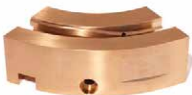
8MM FILL CAM EU-B F-745 | OEM: 3114745