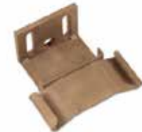
PUNCH SHAFT FELT HOLDER F-753 | OEM: N/A