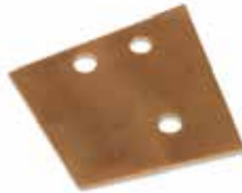
SHIM FOR INJECTOR IPT F-367 | OEM: 3106367