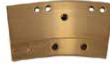
WEAR PLATE - EJECTOR F-003 | OEM: 3109003