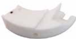
UPPER LOWERING CAM WITH HEAD LUBE - EU 1" - PLASTIC F-84 | OEM: 3112484