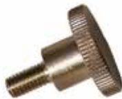
KNURLED SCREW - M6x10 F-408 | OEM: 2143408