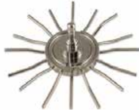
STAINLESS STEEL DISTRIBUTING WHEEL F-459 | OEM: 3512495