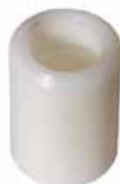
SLIDING SLEEVE FOR F-O-M F-308 | OEM: 3109308