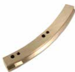
GRIP LEDGE - IPT 1" F-303 | OEM: 3133033