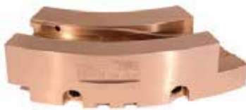
14MM FILL CAM IPT 1" F-4434 | OEM: 3114434