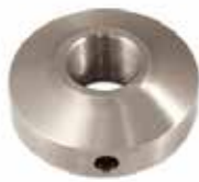
ROTOR SHAFT MUSHROOM HEAD F-029 | OEM: 407029