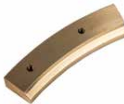
GRIP LEDGE - EU 19 F-989 | OEM: N/A