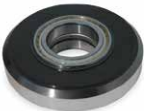
PRESSURE ROLLER W/BEARING F-89/1WB | OEM: 3114089