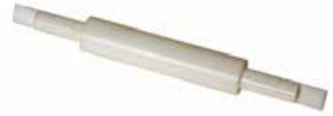
DRIVE SHAFT FOR F-O-M F-307 | OEM: 3109307