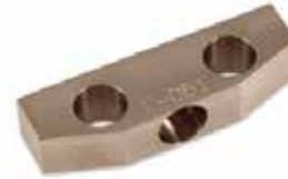
FASTENING FOR GUIDE COLUMNS F-061 | OEM: 3114061