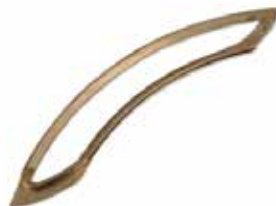
SLIDE-IN BRONZE SEAL FOR STANDARD F-O-M TABLETS UP TO 25MM F-36 | OEM: 3127036