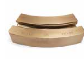
8MM - TRACK SECTION ONLY - IPT 19 FB3-8T | OEM: N/A