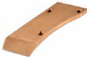
WEAR PLATE FOR EJECTOR F-80 | OEM: 3100180