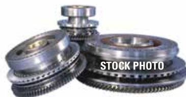
61 STATION TURRET ASSEMBLY* F391-61T/A | OEM: N/A