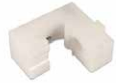
HOLDING BAR FOR PUNCH HEAD - DELRIN - IPT 1" F-169-P | OEM: 32310401691