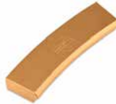
PULL DOWN CAM F-30 | OEM: 3133030