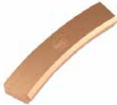
PULL DOWN LEDGE FOR DOSING-IPT 19 F-4 | OEM: 3137164