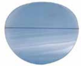
OVAL PANE FOR FEEDING HOPPER 92 MM F-292 | OEM: 3116292