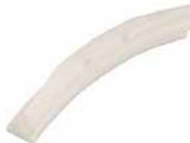
HOLDING RAIL - PRE & MAIN PRESSURE - IPT 19 F-763-P | OEM: 3109763-P