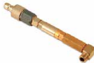
DOSING ELEMENT ASSEMBLY 10 CMM F-030 | OEM: 3700332