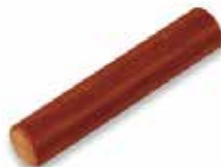
LOWER PUNCH RETAINER F-114 | OEM: N/A