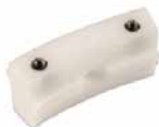
HOLDING BAR W/O SHAFT LUBE - DELRIN - IPT 1" F-162-P | OEM: 32310401621