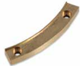
SEGMENT LEFT STOPPER F-33 | OEM: 3111033