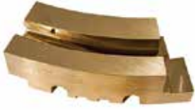
14MM FILL CAM - EU 19 F-566 | OEM: N/A