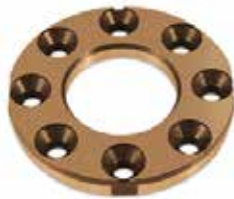
WEAR PLATE F39I-002 | OEM: N/A