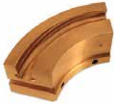
14MM FILL CAM - EU 19 F10-063 | OEM: 3100617