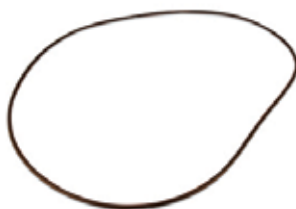
O-RING D=600X8 NBR 70 SHORE A - PUNCH RETAINER F-505 | OEM: 3752505