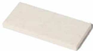
LUBE FELT FOR PUNCH SHANK (WIPING FELT) F-612 | OEM: 3101612