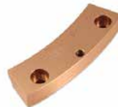
LOWER DOSING CAM - IPT 19 F-928 | OEM: 3110928