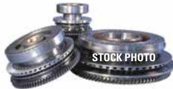
24 STATION TURRET - EU B F12IE-24T | OEM: N/A