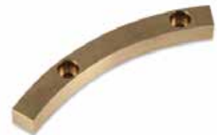
SEALING GASKET - BRONZE (2 HOLE) F3-14/1-1 | OEM: N/A