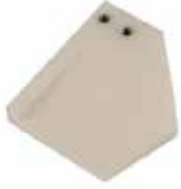
TAIL OVER DIE F-940 | OEM: 3109940