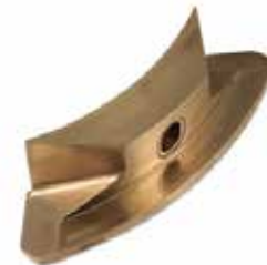
PRESSURE LEDGE- DELRIN F-888-P | OEM: 3113888P