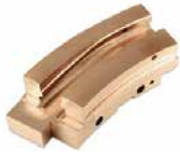
8MM FILL CAM IPT 19 F-482 | OEM: 3113482