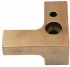
TRANSFER CAM FOR PRE & MAIN PRESSURE STATIONS F-4691 | OEM: N/A