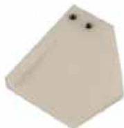
TAIL OVER DIE F-940 | OEM: 3109940