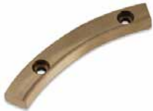
SMALL FEEDER INSERT F-930-3 | OEM: N/A