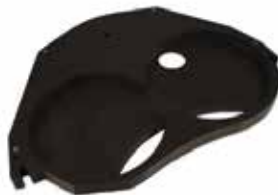
FEEDER PAN F-711 | OEM: 3113711