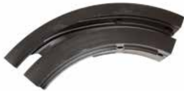
UPPER RAISING CAM - STEEL- IPT 19 F-757 | OEM: N/A

*Turret Assemblies come with Die Locks, Seals, Retainers with hardware, Die Driving Rod, Die Seat Cleaner, Die Insertion Ring, and Cleaning Brush.