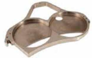
FEEDER PAN F-5 | OEM: 3128805