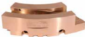
FILLING CAM 14MM IPT 1" F-4434 | OEM: 3114434