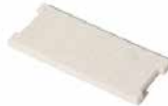
OUTER SHANK FELT 66.3X26X5 F-6487 | OEM: 3126487