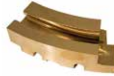
10MM FILL CAM - EU 1" F-065 | OEM: N/A