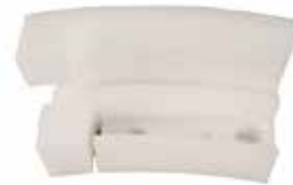
HOLDING RAIL FOR PUNCH HEAD LUBRICATION - IPT 19 F-768-P | OEM: 3109768-P