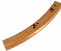
INSIDE GRIP LEDGE - IPT 1" F-755 | OEM: 3109755