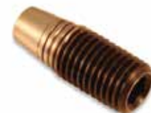
GRUB SCREW FOR MOMENT SUPPORT F-323 | OEM: 3112323