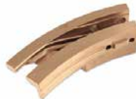
UPPER PUNCH LIFTING CAM IPT 19 F-520 | OEM: 3109520