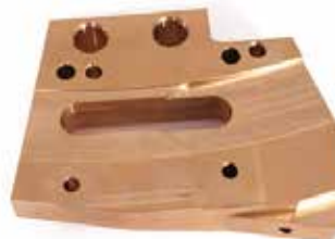
GUIDE PIECE F-353 | OEM: 9138353