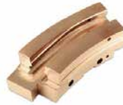
10MM FILL CAM - IPT 1" F-110 | OEM: 3211040110