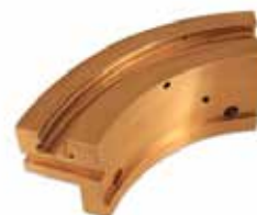
12MM FILL CAM - EU 1" F-822 | OEM: 3101822