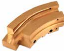
12MM FILL CAM IPT 19 F-413 | OEM: 3114413