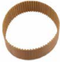
TOOTHED BELT FOR F-O-M DRIVE F-1605 | OEM: 3751605