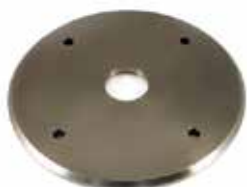
COVER PLATE F-099 | OEM: N/A