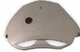
F-O-M BASE PAN F-735 | OEM: 3109735