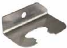
FELT HOLDER/HEAD LUBE DIA 19 FLAT CAMS F-364 | OEM: 3115364