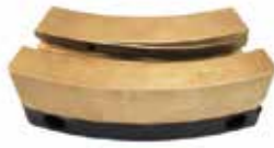
10MM FILL CAM - COMPLETE - IPT 19 FB3-10C | OEM: N/A