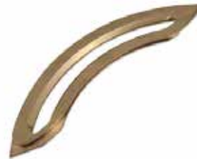
11MM SLIDE IN BRONZE SEAL F-191 | OEM: 3136191