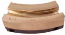
8MM FILL CAM - COMPLETE - IPT 19 FB3-8C | OEM: N/A