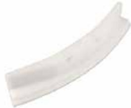
HOLDING BAR FLAT PUNCH - DELRIN - IPT 1" F-165-P | OEM: 32310401651