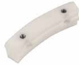
PLASTIC HOLDING LEDGE - PUNCH REMOVAL - DELRIN F-714 | OEM: 3117714