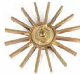
METERING WHEEL W/FLAT RODS F-465 | OEM: 3501465, 3501465C