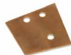
SHIMS FOR EJECTOR PLATE F-59 | OEM: 3113959