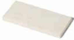
LUBE FELT FOR PUNCH SHANK F-612 | OEM: 3101612