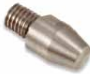
FINDER THREADED PIN FOR ROTOR SHAFT F-936 | OEM: 3119936