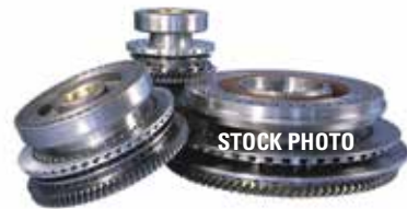
45 STATION TURRET ASSEMBLY* F3-45T | OEM: N/A