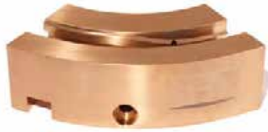
12MM FILL CAM - IPT 19 F-787 | OEM: N/A