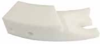
UPPER LOWERING CAM IPT 19 F-692 | OEM: N/A