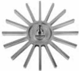
METERING WHEEL W/FLAT RODS - STAINLESS F-465/S | OEM: N/A