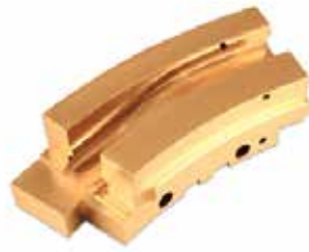
8MM FILL CAM - EU 19 F-806 | OEM: 3778806