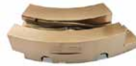
12MM FILL CAM EU 19 F-444 | OEM: 3111444