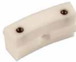
HOLDING RAIL FOR LUBRICATION AREA IPT 19 F-044-P | OEM: 3111044-P