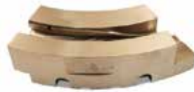
16MM FILL CAM EU 19 F-899 | OEM: 3110899