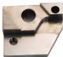
RECEIVER BLOCK F-3836 | OEM: N/A