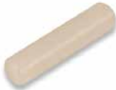
LOWER PUNCH RETAINER F-9 | OEM: N/A