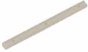
SCRAPER BLADE (DELRIN) F3-4/1 | OEM: N/A