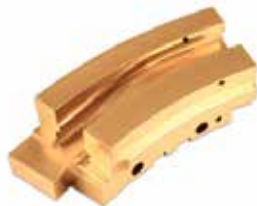
8MM FILL CAM - EU 19 F-07 | OEM: N/A