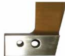
TRANSITION CAM - MAIN COMPRESSION F-967 | OEM: 3108967