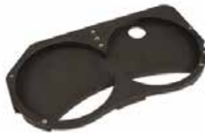
FEEDER PAN ASSEMBLY F-930/A | OEM: N/A