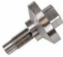
BUSHING FOR SPINDLE (CAP FOR ROTOR SHAFT) F-MC | OEM: N/A