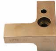
TRANSITION CAM - MAIN COMPRESSION F-3723 | OEM: 3113723