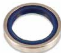
PUNCH GUIDE SEAL 1" ALUMINUM CASING F-549 | OEM: 3115549