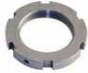
ROLL PIN LOCKNUT F3-87-1 | OEM: N/A