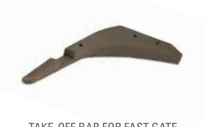
TAKE-OFF BAR FOR FAST GATE F3-01/F | OEM: 44-23-001