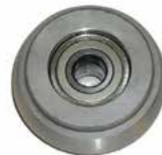
PRE-COMPRESSION ROLL F3-004 | OEM: 31-23-004