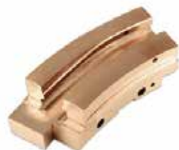
25MM FILL CAM - IPT 1" F39-25 | OEM: N/A