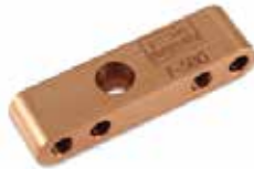
DOSING LEDGE METERING INSERT F-580 | OEM: 3110580