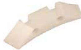
PRESSURE LEDGE PRE & MAIN PRESSURE F-391 | OEM: 3108391