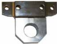
HUB FLANGE F-873 | OEM: 3109873