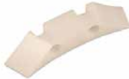
PRESSURE LEDGE PRE & MAIN PRESSURE F-391 | OEM: 3108391