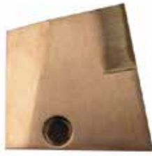
EJECTION / DOSING RAMP F-387 | OEM: 3108387