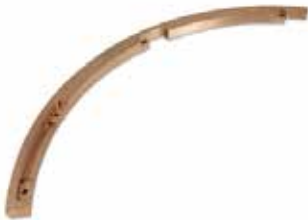
HOLDING LEDGE- IPT 1" F-035 | OEM: 407035