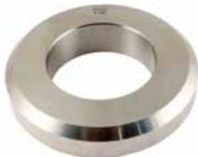
PRESSURE ROLL W/O BEARING F-89 | OEM: 3114089