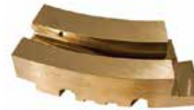
6MM FILL CAM - IPT 19 F-487 | OEM: N/A