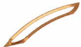
SEGMENT STOPPER F-466 | OEM: 3131466