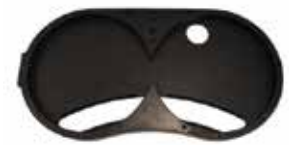
F-O-M BOTTOM PLATE F3-14 | OEM: 44-23-014