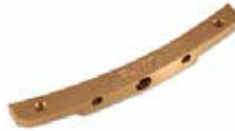
RETAINING PIECE - HOLDING LEDGE - LONG F-957 | OEM: 3108957