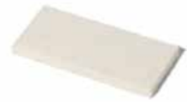
LUBE FELT FOR PUNCH SHANK (WIPING FELT) F-612 | OEM: 3101612