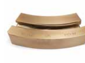
6MM - TRACK SECTION ONLY - IPT 1" FD3-6T | OEM: N/A