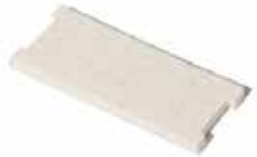
OUTER SHANK FELT 66.3X26X5 F-6487 | OEM: 3126487