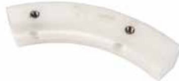
PLASTIC HOLDING LEDGE - PUNCH REMOVAL - EU 19 F-709 | OEM: N/A