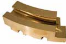
18MM FILL CAM - EU 1" F-069 | OEM: N/A