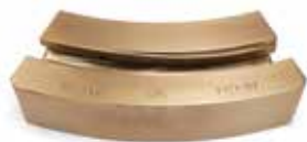
20MM - TRACK SECTION ONLY - IPT 19 FB3-20T | OEM: N/A