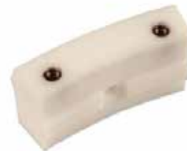
HOLDING RAIL FOR LUBRICATION AREA IPT 1" F-044-P | OEM: 3111044-P