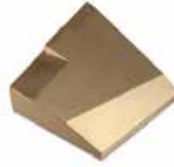
STARTER PIECE FOR EJECTOR F-199 | OEM: 3126199