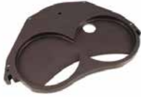
F-O-M BASE PLATE FOR BRONZE SEAL F-7032 | OEM: 3127032