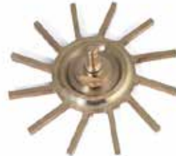
REVERSE DOSING WHEEL W/ FLAT RODS - PLOW F-66/1 | OEM: N/A