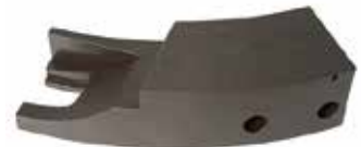
UPPER RAISING CAM - STEEL - EU1/441-ETS F-446 | OEM: N/A