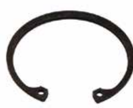
SNAP RING FOR ROLL PIN F3-9A | OEM: N/A