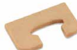
LUBE FELT / HEAD IPT1" EU1 F-426 | OEM: 3115426