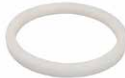
THRUST COLLAR PLASTIC F3-038 | OEM: 3100038