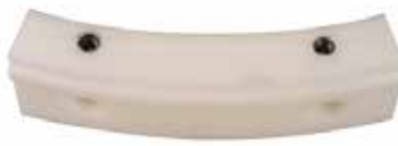
HOLDING BAR FOR PUNCH REMOVAL IPT 19 F-530-P | OEM: 3109530-P