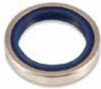
PUNCH GUIDE SEAL 1" UNKEYED ALUMINUM CASING F-549 | OEM: 3115549