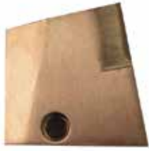
EJECTION / DOSING RAMP F-387 | OEM: 3108387