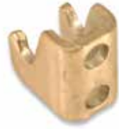
LOCK TENSION JACK COUNTER BEARING F-205 | OEM: N/A