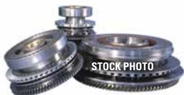
29 STATION TURRET ASSEMBLY* F29-29T/A | OEM: N/A