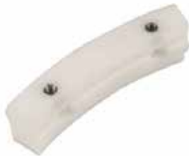
PLASTIC HOLDING LEDGE - PUNCH REMOVAL F-714 | OEM: 3117714