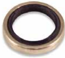
PUNCH SEALS LOWER "B" F-546 | OEM: 3115546