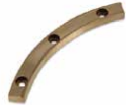
LARGE FEEDER INSERT F-930-2 | OEM: N/A