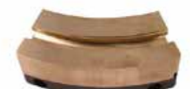
6MM FILL CAM - COMPLETE - IPT 19 FB3-6C | OEM: N/A