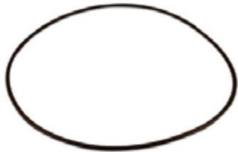
PUNCH RESTRAINER O-RING 400X8 F-1205 | OEM: 3761205