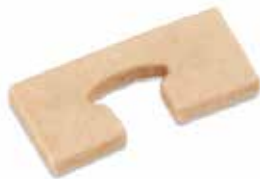
LUBE FELT FOR FLAT CAMS IPT 19, EU 19 F-463 | OEM: 3119463