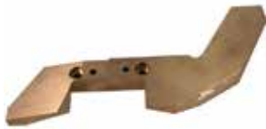
TRANSITION CAM-LOWER PRECOMP. ROLL F-557 | OEM: 3110557