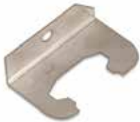
PUNCH HEAD FELT HOLDER F-763 | OEM: N/A