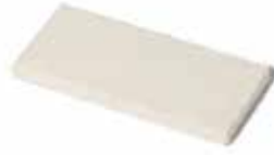
LUBE FELT FOR PUNCH SHANK (WIPING FELT) F-612 | OEM: 3101612