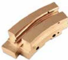
16MM FILL CAM - IPT 19 F-485 | OEM: 3111040116, 3113485