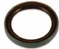
ROTARY SHAFT SEAL F-996 | OEM: 2147996