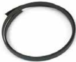
PUNCH RESTRAINER 1" F-406/1 | OEM: 3733406