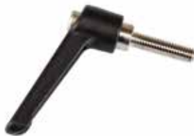
METRIC NYLON ADJUSTABLE HANDLE M8 X 32MM F-42823 | OEM: N/A