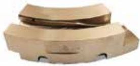
6MM FILL CAM EU 19 F-898 | OEM: 3110898