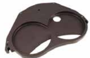
F-O-M BASE PLATE FOR BRONZE SEGMENT F-747 | OEM: 313747