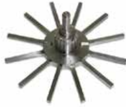
ROTARY VANE F-096/2 | OEM: N/A