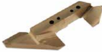
TRANSITION CAM PRE-COMPRESSION F12-722 | OEM: 3113722