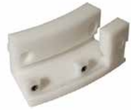
LUBE CAM FOR HEAD & OUTER SHANK - EU1/441 F-3023 | OEM: 3133023