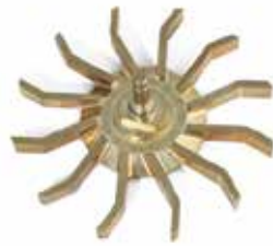
FILLING WHEEL W/FLAT RODS - BRONZE F-464 | OEM: 3501464, 3501464C