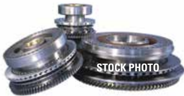
37 STATION TURRET ASSEMBLY* F3-37T | OEM: N/A