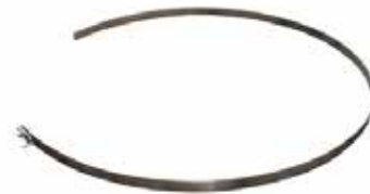
CLAMP FOR PUNCH RESTRAINER 19 MM F-86 | OEM: 3115486