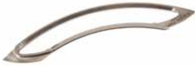
SLIDE-IN SEAL F-O-M TABLETS TO 25MM - STAINLESS F-4636/S | OEM: N/A