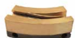
20MM FILL CAM - COMPLETE - IPT 19 FB3-20C | OEM: N/A