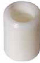
SLIDING SLEEVE FOR F-O-M F-308 | OEM: 3109308