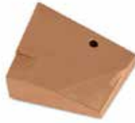
WEIGHT ADJUSTER F-086 | OEM: 3134086