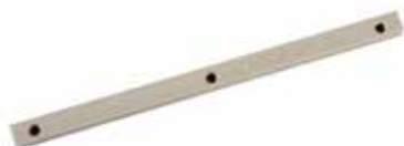
SCRAPER - PEEK F-362/P | OEM: N/A