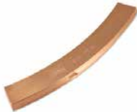
GRIP LEDGE FOR DOSING F-29 | OEM: 3133029