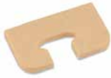
LUBE FELT FOR FLAT CAMS IPT19, EU19 F-365 | OEM: 3115365