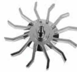
FILLING WHEEL - STAINLESS F-464/S | OEM: N/A