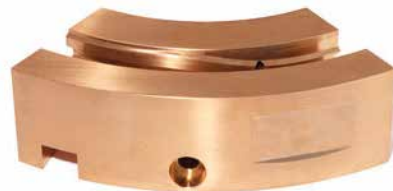
14MM FILL CAM - EU 19 F-809 | OEM: 3115809