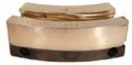
10MM FILL CAM - COMPLETE - IPT 1" FD3-10C | OEM: N/A