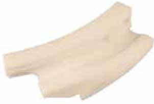
LOWERING CAM - IPT 19 - DELRIN F-27 | OEM: 3136027