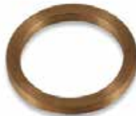
WASHER - TAMPING ROLLER ASSEMBLY F-304 | OEM: 3100304