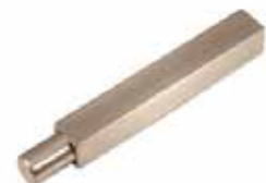
GUIDE KEY F-588 | OEM: 3109588, 3115597