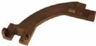
TRANSITION CAM BETWEEN PRECOMP & MAIN ROLLER F-321 | OEM: XX4321