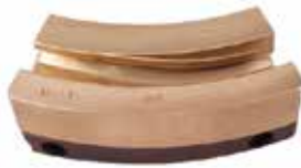
11MM FILL CAM - EU 1"/441 F-56212 | OEM: 531-67-22-18-253