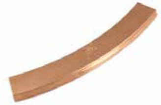
GRIP LEDGE FOR DOSING-IPT 19 F-3 | OEM: 3137163