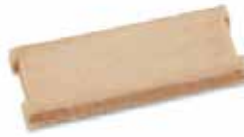
WIPING FELT F-28 | OEM: 3133028