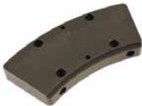
12MM BASE SECTION ONLY F3-12B | OEM: N/A