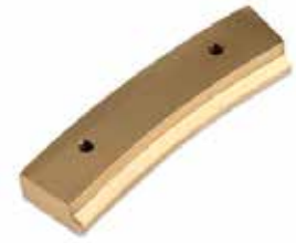
PULL DOWN CAM - DOSING F-034 | OEM: 3133034