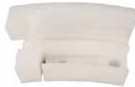
HOLDING RAIL FOR PUNCH HEAD LUBRICATION - IPT 19 F-768-P | OEM: 3109768-P