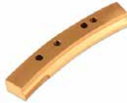
PULL DOWN CAM FOR EJECTOR-IPT 19 F-8 | OEM: 3136028