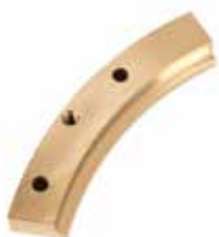
LOWER PRESSURE RAIL EU1-441 F-21 | OEM: 3114521