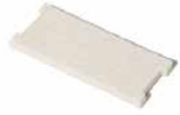
OUTER SHANK FELT 66.3X26X5 F-6487 | OEM: 3126487