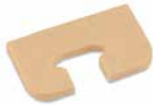
LUBE FELT FOR FLAT CAMS IPT19, EU19 F-365 | OEM: 3115365