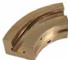
12MM FILL CAM EU-1" F-26 | OEM: 3114826