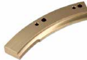
HOLD DOWN LEDGE - IPT 19 F-929 | OEM: 3110929