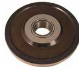
PRESSURE ROLL WITH BEARING F-6 | OEM: 3023006