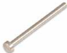
HINGE PIN 4MMx50MM F-421 | OEM: 3104421