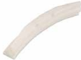
HOLDING RAIL - PRE & MAIN PRESSURE - IPT 19 F-763-P | OEM: 3109763-P