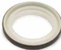
PUNCH GUIDE SEAL - 1" F-624 | OEM: 2214624