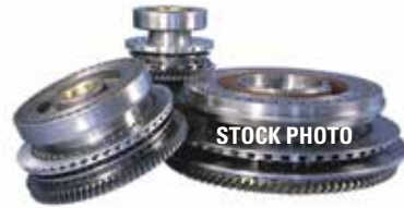
29 STATION TURRET ASSEMBLY* F29-29T | OEM: N/A