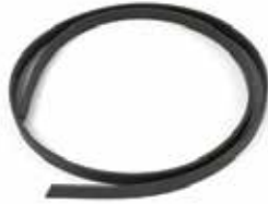
PUNCH RESTRAINER 19 F-406 | OEM: 3733406