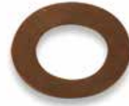
SPRING WASHER DIN2090-B16 F-950 | OEM: 2142950