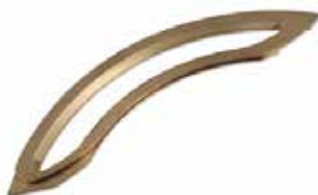
16MM SLIDE IN BRONZE SEAL F-192 | OEM: 3136192