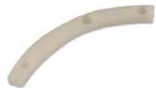
SEALING GASKET - DELRIN (3 HOLE) F3-14/1-2P | OEM: N/A