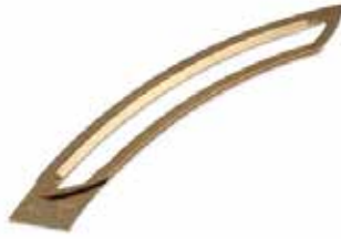
SLIDE IN BRONZE SEAL 16MM F-39 | OEM: 3128639