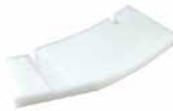
COVER PLATE - PUNCH REMOVAL - DELRIN F-172-P | OEM: 33330401723