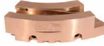
10MM FILL CAM IPT 1" F-432 | OEM: 3114432