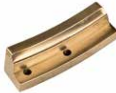
LOWERING CAM - A2 - EU 19 F10-048 | OEM: N/A