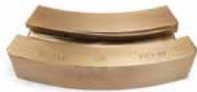
16MM - TRACK SECTION ONLY - IPT 19 FB3-16T | OEM: N/A