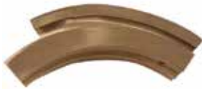
UPPER LIFTING CAM - EU19 F21-431 | OEM: 3101431