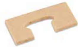
LUBE FELT/HEAD IPT1" EU1" FLAT F-026 | OEM: 3133026