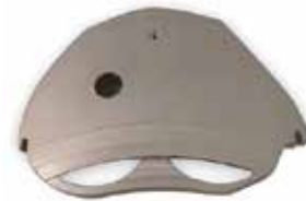
FEEDER BASE PAN F-735 | OEM: 3109735