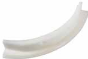
HOLDING LEDGE PRE/MAIN COMPRESSION - EU 19 F-721 | OEM: N/A