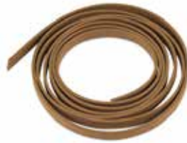
PUNCH RESTRAINER 19 F-605 | OEM: 3752605