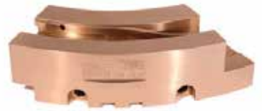
16 MM FILL CAM - EU1 - 441 F-842-16 | OEM: N/A

*Turret Assemblies come with Die Locks, Seals, Retainers with hardware, Die Driving Rod, Die Seat Cleaner, Die Insertion Ring, and Cleaning Brush.