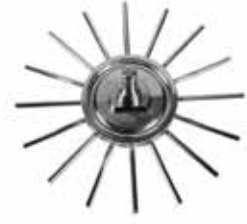
DOSING WHEEL WITH ROUND RODS F-816 | OEM: N/A