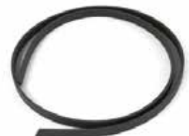
PUNCH RESTRAINER 19 F-406 | OEM: 3733406