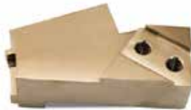
BASE PLATE FOR EJECTOR F-3900 | OEM: 3113900