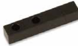
SQUARE STEEL F-537 | OEM: 3110537