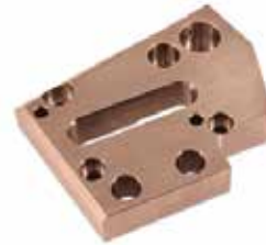
GUIDE PIECE F-103 | OEM: 3133103