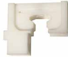
HEAD LUBE CAM - EU 19 F-390 | OEM: 3118390