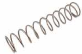
COMPRESSION SPRING - TURRET BOLT F-028 | OEM: F407028