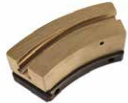
12MM FILL CAM - COMPLETE - IPT 19 FB3-12C | OEM: N/A