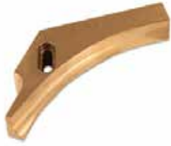
TABLET SCRAPER AIR REJECT F-479 | OEM: 3123479