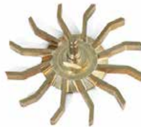
FILLING WHEEL - BRONZE F-464 | OEM: 3501464, 3501464C