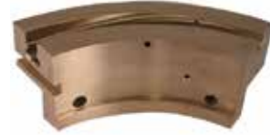
12MM FILL CAM - IPT 19 F21-816 | OEM: 3101816