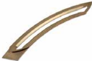
SLIDE IN BRONZE SEAL (OPEN) 11MM F-636 | OEM: 3128636