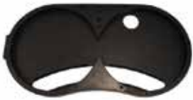
FILL-O-MATIC BOTTOM PLATE F3-14/2 | OEM: N/A