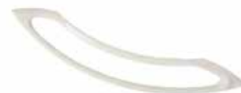
SLIDE-IN DELRIN SEAL FOR STANDARD F-O-M TABLETS UP TO 25MM F-4636/D | OEM: N/A