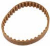
TOOTHED BELT FOR F-O-M F-305 | OEM: 3795305