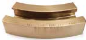
11MM - TRACK SECTION ONLY - EU1" FD3-11TE4 | OEM: N/A