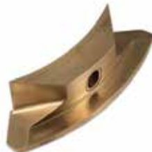
PRESSURE LEDGE F-888 | OEM: 3113888