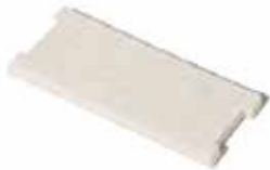
OUTER SHANK FELT 66.3x26x5 F-6487 | OEM: 3126487