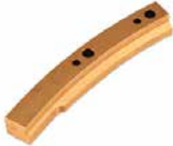
LEDGE CAM FOR EJECTION - IPT 1" F-036 | OEM: 407036