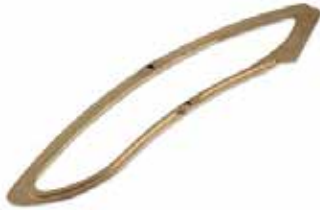
FEEDER PAN INSERT F-735-2 | OEM: N/A