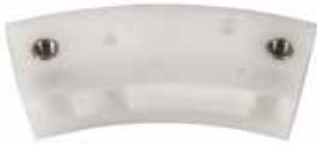
PLASTIC HOLDING LEDGE/ SHANK LUBE - EU19 F-396-EU19 | OEM: N/A