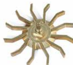
FILLING WHEEL - PLOW F-464/1 | OEM: 3501464