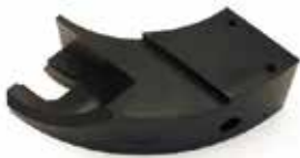
UPPER RAISING CAM - EU 1" - STEEL F-356 | OEM: 3118356