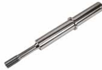
THREADED SPINDLE (ROTOR SHAFT) F-RS | OEM: N/A