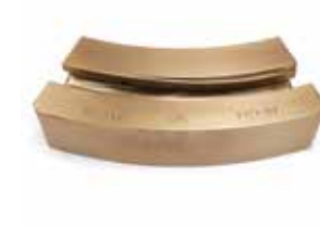
6MM - TRACK SECTION ONLY - IPT 19 FB3-6T | OEM: N/A