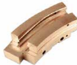
16MM FILL CAM - IPT 19 F-485 | OEM: 3111040116, 3113485