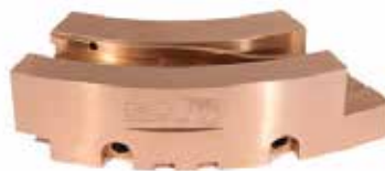
8MM FILL CAM IPT-19 F-410 | OEM: 3114410