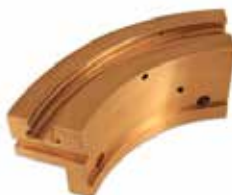
12MM FILL CAM - EU 19 F-808 | OEM: N/A