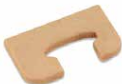
PUNCH HEAD LUBE FELT - IPT 1" F-761 | OEM: 32710401761