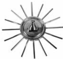
DOSING WHEEL WITH ROUND RODS F-816 | OEM: N/A