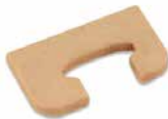
LUBE FELT / HEAD IPT1"EU1 F-426 | OEM: 3115426