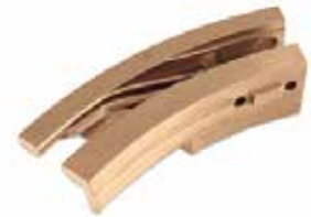
UPPER LIFTING CAM IPT 1" F-180 | OEM: 32110401801