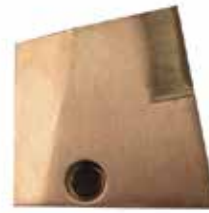
EJECTION / DOSING RAMP F-387 | OEM: 3108387