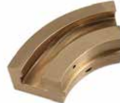
14MM FILL CAM - EU1"/441 F-754 | OEM: 3114754