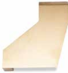
RAMP F21-429 | OEM: 3101429