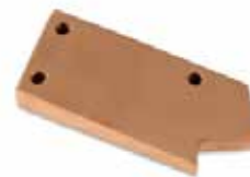
EJECTION PLATE F-81 | OEM: 3100181