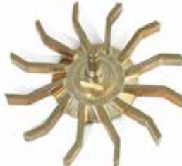
FILLING WHEEL - PLOW F-464/1 | OEM: N/A