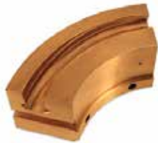
12MM FILL CAM - EU19 F10-062 | OEM: 3100616