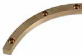
SEALING GASKET - BRONZE (3 HOLE) F3-14/1-2 | OEM: N/A