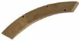
DOSING WEAR PLATE F-155 | OEM: 3100155