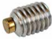
M5 BRASS TIPPED SET SCREW 90418A343 | OEM: N/A