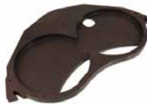
F-0-M BOTTOM PLATE F2-24 | OEM: 44-06-020