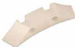
PRESSURE LEDGE PRE & MAIN PRESSURE F-391 | OEM: 3108391