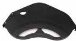
FEEDER BASE PAN F-534 | OEM: 3101534