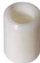
SLIDING SLEEVE FOR F-O-M F-308 | OEM: 3109308