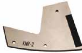
WEAR PLATE KNR-2 | OEM: N/A