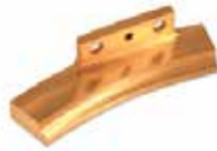
CATCH CAM - IPT B KI-928/2 | OEM: N/A