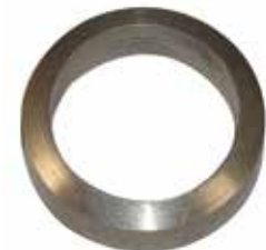
PUNCH BUSHING KI-129 | OEM: N/A