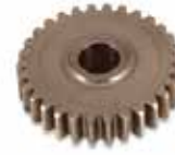
FEEDER GEAR KI-C025 | OEM: TX-FIIC-025