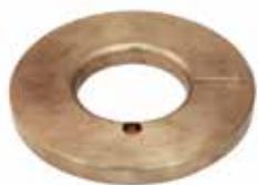
THRUST WASHER KI-003 | OEM: RXC2-031, TXB2-003