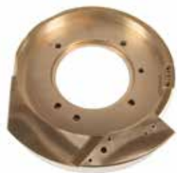
MAIN UPPER CAM TRACK - EU "B" KI-405 | OEM: N/A