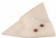
TAIL OVER DIE KI-353 | OEM: 116353