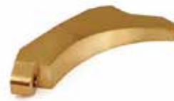
EJECTION PLATE - NOTCHED K14-309/3 | OEM: N/A