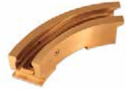
FILL CAM 8.5-16MM - IPT D LUBRICATED KI-224 | OEM: 157224