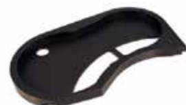
FILL SHOE KI-C001 | OEM: TX FIC-001