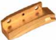
UPPER SECTION CONTROL RAIL - IPT B KI-696 | OEM: 250696