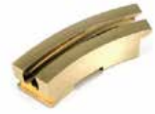
FILL CAM 4.5-12MM - IPT B KI-785 | OEM: 130785