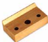
CATCH RAIL IPT B - EJECTION KI-831 | OEM: 108831