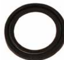
UPPER PRECOMPRESSION ROLL SEAL K15-C5216 | OEM: TXC5-216