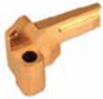
EJECTION CAM KI-388 | OEM: 180388