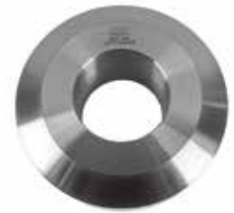
PRESSURE ROLLER KI-12 | OEM: N/A