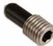
DIE LOCK SCREW DL-137 | OEM: 136137