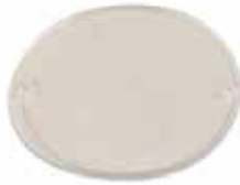
SIGHT GLASS KI-536 | OEM: 107536