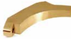
EJECTION PLATE KI-308/3 | OEM: 107308/8