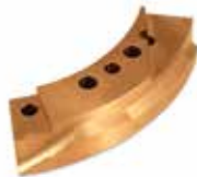
FILL CAM IPT - B KI-585 | OEM: 10249585