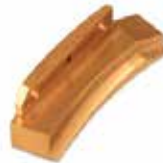
CONTROL CAM - IPT D KI-752 | OEM: 250752