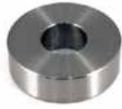
PRE-COMPRESSION ROLL KI-233 | OEM: 108233, 10108233