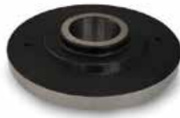
MAIN PRESSURE ROLLER KI-705 | OEM: 125705