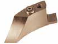
UPPER LOWERING ROOF CAM COMPLETE KI-600 | OEM: N/A