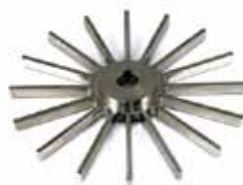
LARGE AGITATOR KI-C051 | OEM: 154232