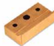
CATCH RAIL EU B - EJECTION KI-831/1 | OEM: N/A