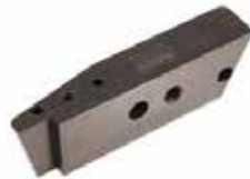
TRANSITION PIECE - STEEL KI-572 | OEM: 108572