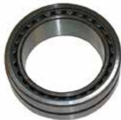
NEEDLE BEARING FOR UPPER ROLL PIN K15-C1202 | OEM: TXC1-202