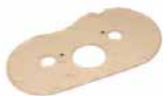
FEEDER COVER FIIC-602 KI-091 | OEM: 108091/9