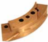
FILL CAM - IPT D K14-517/1 | OEM: 130517/EUD