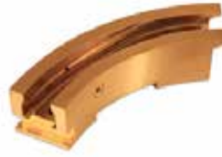
FILL CAM 4.5-12MM - IPT D LUBRICATED KI-223 | OEM: 157223