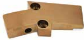
DOSING CAM K4-214 | OEM: 140214