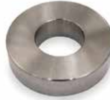
PRE-COMPRESSION ROLLER KI-120 | OEM: 195120