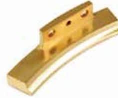
CATCH CAM - IPT D KI-929/2 | OEM: 444929