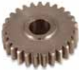
FEEDER GEAR KI-C023 | OEM: TX-FIIC-023