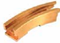
FILL CAM 12MM - BRONZE KI-323 | OEM: 108323