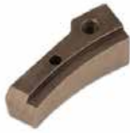
EJECTION CAM KNR-1 | OEM: N/A