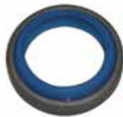
UNKEYED PUNCH GUIDE SEAL "B-TYPE" KI-418 | OEM: 126418