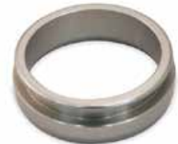
BELLOWS RETAINER KI-3510 | OEM: N/A