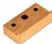
CATCH RAIL EU B - EJECTION KI-831/1 | OEM: N/A