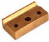
CATCH RAIL EU "D" - EJECTION KI-847/1 | OEM: N/A