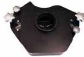
FEEDER ASSEMBLY KI-100/A | OEM: N/A