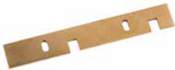
SCRAPER BLADE K-RL1 | OEM: N/A