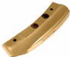
EJECTION CAM KI-459/6 | OEM: 108459/6