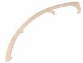
GRAVITY FILL SHOE INSERT - WHITE NYLATRON KI-183 | OEM: 206183