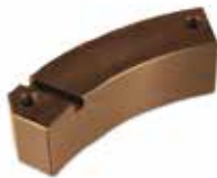
EXTENSION PIECE K15-B1011 | OEM: TXB1-001