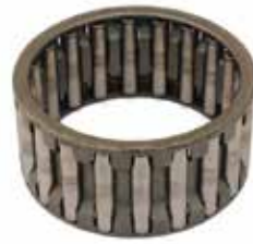
PRESSURE ROLL BEARING K15-C2200 | OEM: C2200, TXC2-200