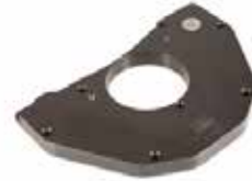
UPPER GEAR HOUSING KI-C004 | OEM: TX FIIC-004