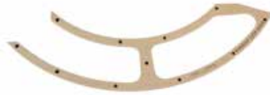
SEAL SEGMENT - PEEK KI-605/3-P | OEM: N/A