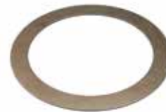
THRUST BEARING WASHER K15-C2007 | OEM: TXC2-007