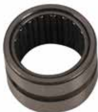
UPPER PRE COMP ROLL PIN NEEDLE BEARING K15-C5213 | OEM: TXC5-213