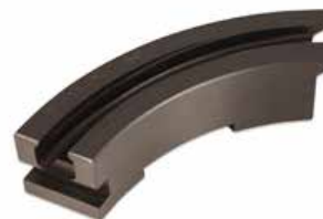
0.5 - 8MM FILL LOWER PULLDOWN CAM - EU B K15-S21001/EU | OEM: TX-S21-001