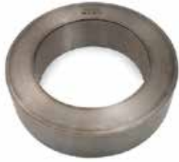
PRESSURE ROLL - NEW STYLE KI-067 | OEM: 257067