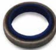
UNKEYED PUNCH GUIDE SEAL "D-TYPE" KI-416 | OEM: 126416