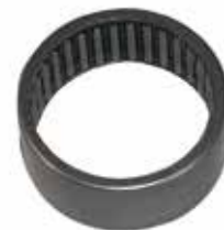
UPPER PRE-COMP ROLL PIN BEARING K15-C5212 | OEM: TXC5-212