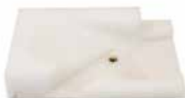
COVERINA SEGMENT (TAIL OVER DIE) FROM SERIES 32014 K15-C440 | OEM: TXFIC-440