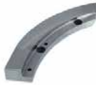
EJECTION CAM - "B" - STEEL KI-931/S | OEM: 108931