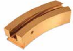
FILL CAM 16MM - IPT-B KI-428 | OEM: 162428

*Turret Assemblies come with Die Locks, Seals, Retainers with hardware, Die Driving Rod, Die Seat Cleaner, Die Insertion Ring, and Cleaning Brush