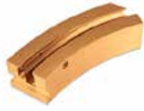
FILL CAM 8MM - IPT-B KI-426 | OEM: 162426