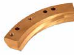
FILL CAM OUTER 20MM - IPT B KI-582 | OEM: 10249582