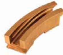
FILL CAM 8.5-16MM - IPT D KI-685 | OEM: 157685