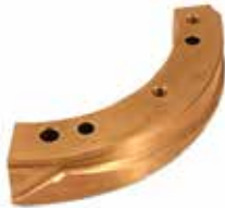
FILL CAM INNER 20MM FILL - EU D K14-520 | OEM: N/A