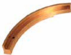
RAISING CAM KI-875 | OEM: 169875/1