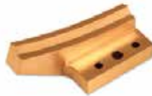
CATCH RAIL KI-343 | OEM: 108343