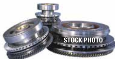
67 STATION TURRET ASSEMBLY* K4-67T | OEM: N/A