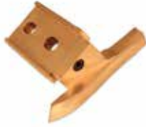
LOWERING CAM SEGMENT KI-164/2 | OEM: 171164