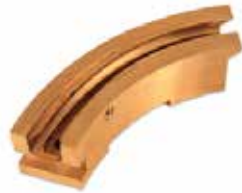
FILL CAM 0.5-8MM - IPT B LUBRICATED KI-660 | OEM: 153660