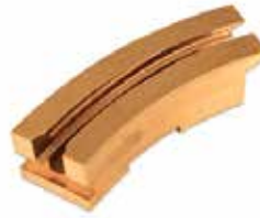
FILL CAM 0.5-8MM - IPT B KI-784 | OEM: 130784