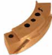
FILL CAM - EU D K14-517 | OEM: 130517/EUD