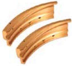
FILL CAM SET 20MM - IPT D KI-238 | OEM: 225238