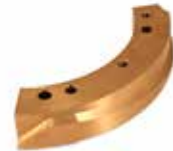
FILL CAM INNER 20MM IPT-B KI-583 | OEM: 10249583