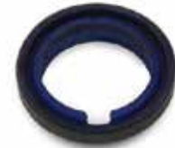
KEYED PUNCH GUIDE SEAL - "D-TYPE" KI-417 | OEM: N/A