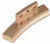
MOTOR PULLEY BEARING KI-G203/1 | OEM: N/A