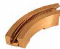
FILL CAM 12.5MM - 20MM - IPT B KI-099-1 | OEM: N/A