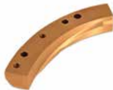
FILL CAM OUTER 20MM FILL - IPT D K14-519/1 | OEM: N/A