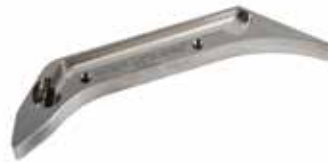
TAKE OFF BAR KI-152/1 | OEM: N/A