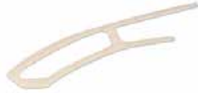
SEALING SEGMENT KI-804 | OEM: 231804