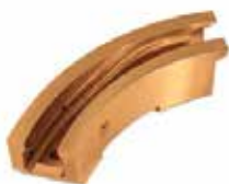
FILL CAM 12.5-20MM - LUBRICATED - IPT D KI-007 | OEM: 158007