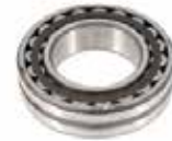
BEARING FOR ECCENTRIC ROLL PIN KI-48 | OEM: 22214E