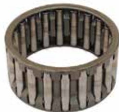
PRESSURE ROLL BEARING K15-C2200 | OEM: C2200, TXC2-200