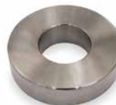
PRE-COMPRESSION ROLLER KI-120 | OEM: 195120