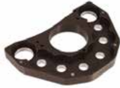
LOWER GEAR HOUSING KI-C003 | OEM: TX FIIC-003