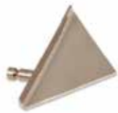
SCRAPER KI-717 | OEM: 136717