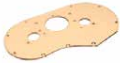
FEEDER PAN COVER KI-C002 | OEM: TX FIIC-002