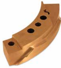
FILL CAM - EU D K14-517 | OEM: 130517/EUD