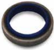
PUNCH GUIDE SEAL "D-TYPE" (UNKEYED) KI-416 | OEM: 126416