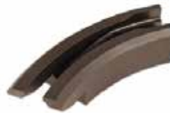
PULL DOWN CAM KNR-715 | OEM: 7-15/39-14