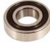
FILL SHOE BEARING KI-C071 | OEM: TX-FIIC-071