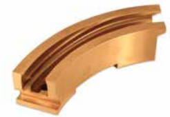
FILL CAM 4.5MM - 12MM - EU D KI-716 | OEM: 130716