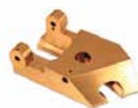
CONTROL CAM - IPT-B KI-613 | OEM: 164613