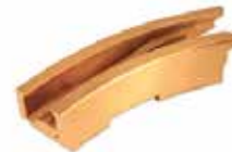
FILL CAM 20MM-BRONZE KI-797 | OEM: 130797