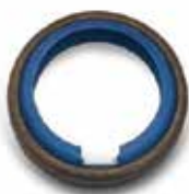
PUNCH GUIDE SEAL "B-TYPE" KI-419 | OEM: 126419