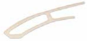
SEALING SEGMENT KI-804 | OEM: 231804