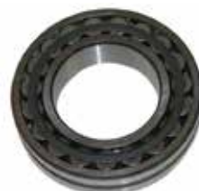
MOTOR PULLEY BEARING KI-G203/1 | OEM: N/A