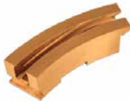
FILL CAM 8.5-16MM - IPT B KI-786 | OEM: 130786