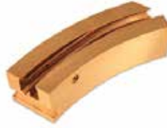
FILL CAM 12MM - IPT-B KI-427 | OEM: 162427