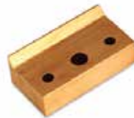
CATCH RAIL IPT "B" - EJECTION KI-831 | OEM: 108831