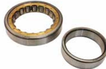
UPPER YOKE SPINDLE BEARING K15-C1200 | OEM: TXC1-200