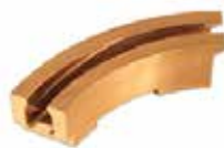
FILL CAM 12.5MM - 20MM - EU B KI-099 | OEM: 145099