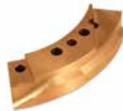
FILL CAM - IPT B KI-585 | OEM: 10249585