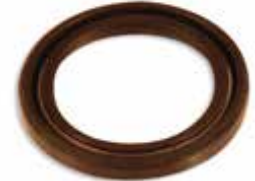
SEAL FOR BEARING HOUSING KI-C030/1 | OEM: TXFIC-030