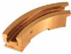
FILL CAM .5-8MM - IPT D LUBRICATED KI-221 | OEM: 157221