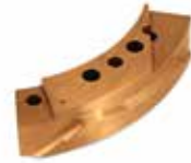
FILL CAM - IPT D K14-517/1 | OEM: N/A