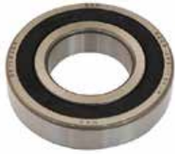
DRIVE PULLEY BEARING K15-G2200 | OEM: TXG2-200