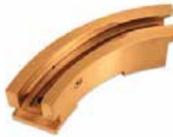
FILL CAM 4.5 - 12MM - IPT B LUBRICATED KI-661 | OEM: 153661