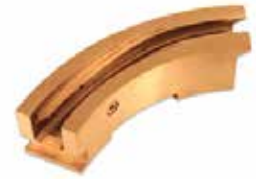
FILL CAM 8.5 16MM - IPT B LUBRICATED KI-662 | OEM: 153662