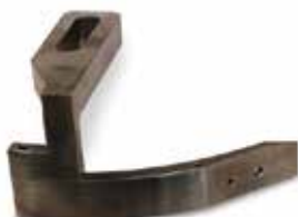
TABLET STRIPPER (TAKEOFF) K15-B1001 | OEM: 148169/1