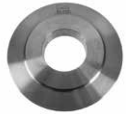
PRESSURE ROLLER - EU B KI-566 | OEM: 10233566