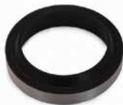
PUNCH GUIDE SEAL 30MM KI-4M43 | OEM: N/A