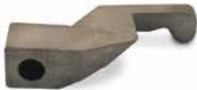
PRE COMPRESSION CAM KI-924 | OEM: 10110924