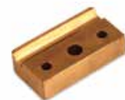
CATCH RAIL IPT D - EJECTION KI-847 | OEM: 108847