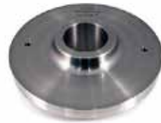
MAIN PRESSURE ROLL KI-705/1 | OEM: 125705