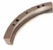
OUTER FILL CAM KI-612 | OEM: 148263