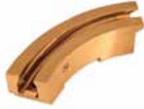
DOSING CAM KI-747 | OEM: 127747