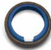
KEYED PUNCH GUIDE SEAL "B-TYPE" KI-419 | OEM: 126419