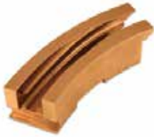
FILL CAM .5-8MM - IPT D KI-682 | OEM: 157682