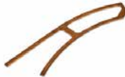
FEED FRAME INSERT K4-167 | OEM: N/A