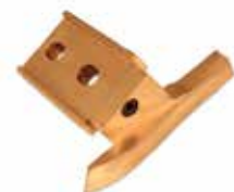
LOWERING CAM SEGMENT KI-164/2 | OEM: 171164