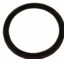
UPPER PRE COMP ROLL PIN SEAL K15-C5215 | OEM: TXC5-215