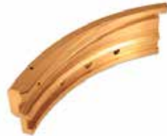
CAM OUTER HALF 20MM -IPT D KI-170 | OEM: 10221170