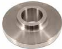
UPPER OR LOWER PRESSURE ROLL KI-054 | OEM: 109054