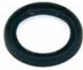
SEALING RING FOR FEEDER DRIVE SHAFT KI-C070 | OEM: N/A