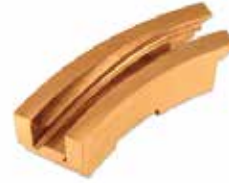
FILL CAM 12.5MM-20MM - IPT D KI-226 | OEM: 151226