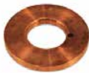
INNER WEARING WASHER KI-252 | OEM: 108252