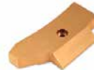
CONTROL CAM KI-348 | OEM: 108348