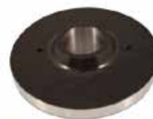
PRESSURE ROLL KI-225 | OEM: 108225