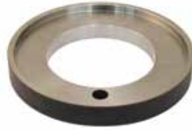
OUTER STOP RING K15-C2009 | OEM: TXC2-009