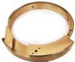
UPPER CAM TRACK - BRONZE - IPT B K15-F17002 | OEM: TXF-17002