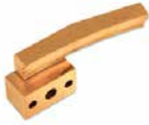
STOP RAIL - IPT B KI-009 | OEM: 119009