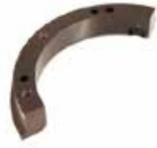
INNER FILL CAM KI-512 | OEM: 148261