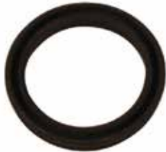
LOWER PRECOMP CYLINDER SEAL K15-B5202 | OEM: TXB5-202