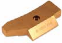
CONTROL CAM - IPT D KI-577 | OEM: 157577