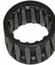
PRECOMPRESSION ROLL BEARING K15-B5203 | OEM: TXB5-203