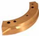
FILL CAM 20MM IPT B KI-77 | OEM: 10249577