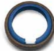
PUNCH GUIDE SEAL "B-TYPE" KI-419 | OEM: 126419