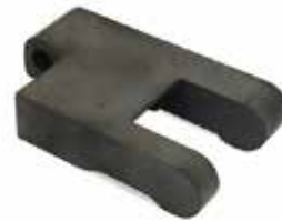
LINK TRACK K15-B1014 | OEM: TXB1-014