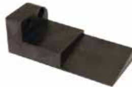
TRANSFER CAM K15-B1017 | OEM: TXB1-017