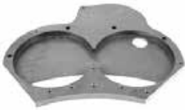
FILL SHOE FIII FS ALUMINUM KI-669 | OEM: 239669