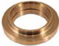
PRESSURE ROLLER KI-956 | OEM: 10190956