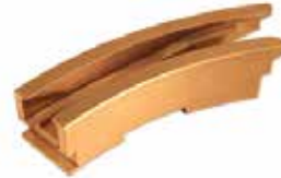
FILL CAM 16 MM - BRONZE - IPT B KI-324 | OEM: 108324