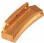
CONTROL CAM - IPT B KI-751 | OEM: 250751