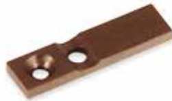
TILT LEVER - BRAKE PIN KI-940 | OEM: 107940