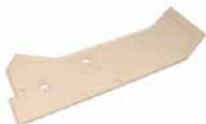
TABLET CHUTE KI-184 | OEM: 158184