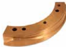
FILL CAM INNER 20MM FILL - IPT D K14-520/1 | OEM: N/A