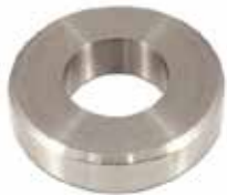
PRESSURE ROLL KI-286 | OEM: 183286