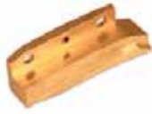
UPPER SECTION CONTROL CAM - IPT D KI-697 | OEM: 250697