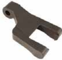
PIVOT PLATE KNR-4 | OEM: N/A