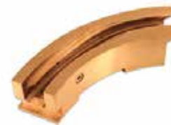
FILL CAM 8.5 - 16MM - IPT B KI-662 | OEM: 153662