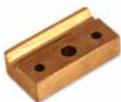
CATCH RAIL IPT D - EJECTION KI-847 | OEM: 108847