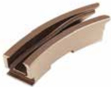
FILL CAM 16 MM - STEEL KI-324/1 | OEM: 108324