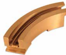
FILL CAM 8.5MM - 16MM - IPT B KI-713 | OEM: 130713