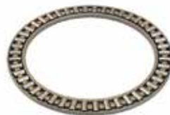
THRUST BEARING K15-C2208 | OEM: TXC2-208