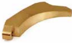
EJECTION PLATE - NOTCHED K14-309/3 | OEM: N/A