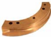
FILL CAM INNER 20MM FILL - IPT D K14-520/1 | OEM: N/A