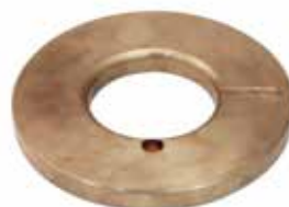
THRUST WASHER KI-003 | OEM: RXC2-031, TXB2-003