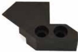
INTERMEDIATE CAM K15-B1016 | OEM: TXB1-016