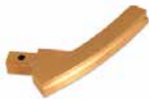
DOSING CAM SAFETY RAIL US "B" TOOLING KI-830 | OEM: 108830