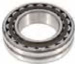
BEARING FOR ECCENTRIC ROLL PIN KI-48 | OEM: 22214E